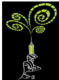
Reanimator The Musical